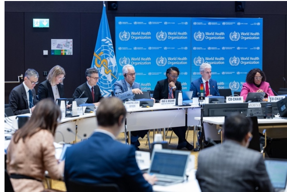
Figure 3: Seventh meeting of the Seventh meeting of the Intergovernmental Negotiating Body (INB) for a WHO instrument on pandemic prevention, preparedness and response

Pandemic Accords. Similarly, Students for Global Health appreciates the WHO's commitment to engaging with civil societies and youth initiatives (e.g. WHO Civil Society Commission, WHO Youth Council), recognising their key role in global health advocacy.