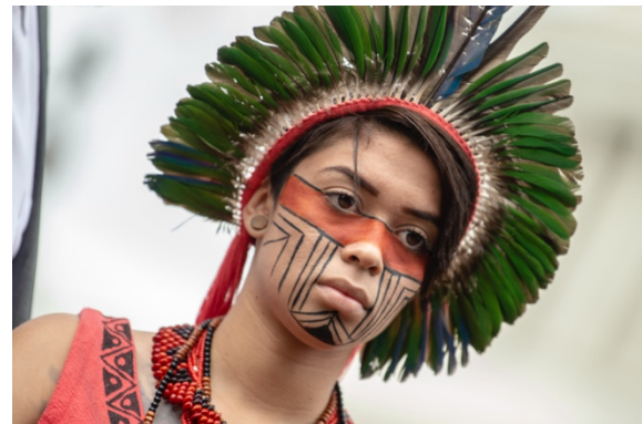
Figure 7: Artemisa Xakriabá, a 19-year-old indigenous climate activist

the increasing powers and brutality of policing powers and recognise that in facing an uncertain future, the right to protest and critique is paramount. No one should face intimidation or violence in voicing concerns for planetary health.