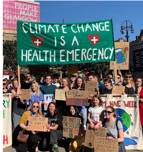
Figure 6: SfGH members at a climate protest (2021)

Equity in face of climate change requires mitigation measures from high-contributing countries to compensate for both their historic and current disproportionate contributions to climate change, and their contribution in the implementation of National Adaptation Plans of countries with high exposure. This includes strengthening health systems while considering their vulnerability to climate-induced events, and the need to adapt to climate-induced illnesses.