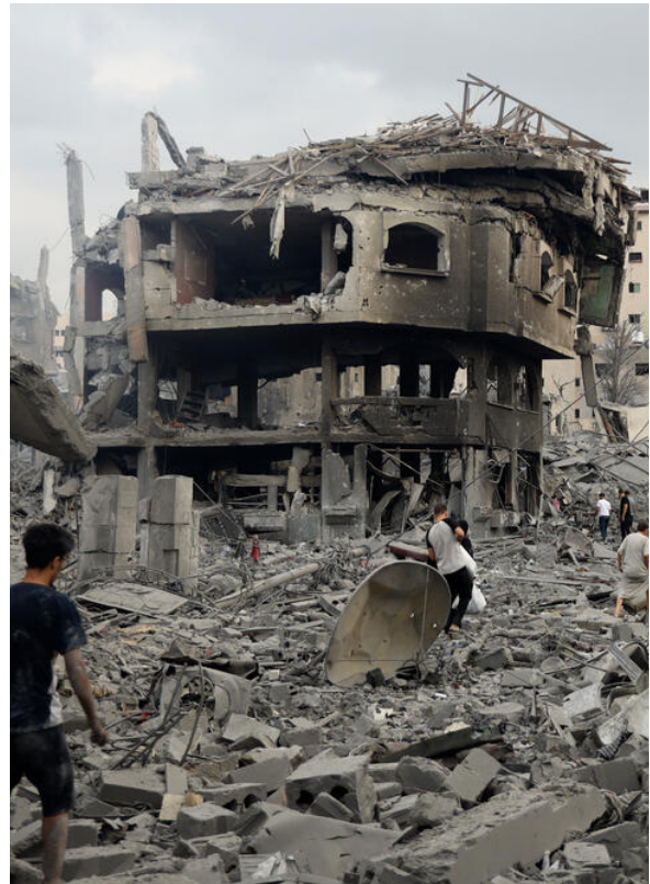
Figure 4: Palestinians walking down a destroyed street in Gaza

Populations living in conflict zones are facing compounded challenges, as highlighted by Médecins Sans Frontières at the eighth INB meeting. The strengthening of health systems that is critical to pandemic preparedness and health equity is severely undermined when medical staff is killed, healthcare facilities are destroyed, and populations are impoverished by conflict. For instance, the ongoing “continuing attacks on healthcare” (UN, 2024) in Gaza and the West Bank not only create a humanitarian crisis, but also jeopardise the long-term resilience and capacity of communities and health systems to confront future pandemics.