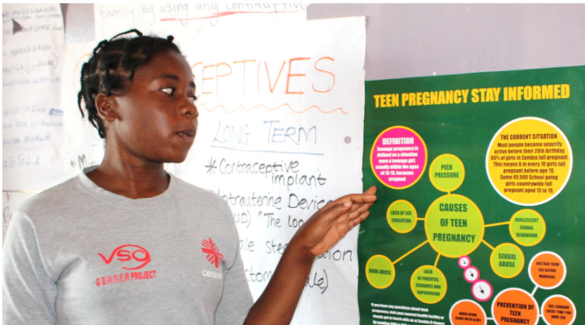
Figure 7: An adolescent girl at a youth resource centre in North-Western Province, Zambia, explains the consequences of teenage pregnancy to her peers. The centre is supported by UNFPA and provides sexual and reproductive health information to young people ( UNFPA Zambia, 2020 )

requirement is therefore a considerate global health strategy, led by the UK, that encourages innovation in digital health across borders.